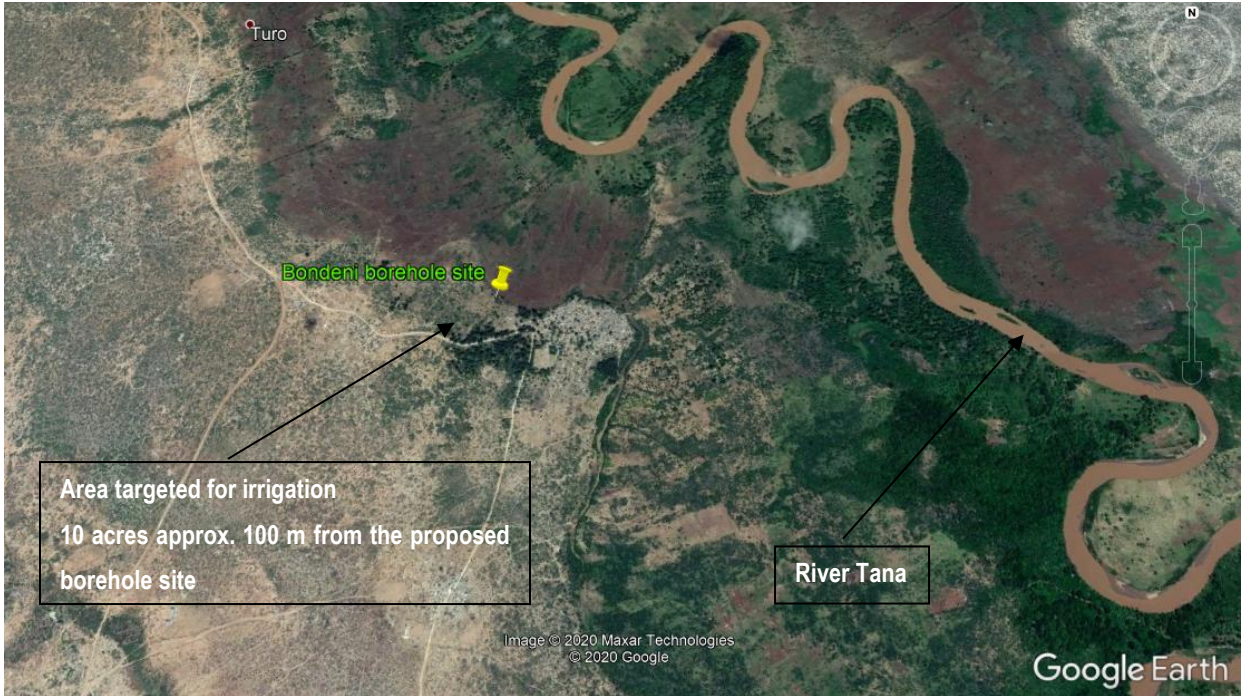
Fig-1: Google map extract Showing the Location of Project Area