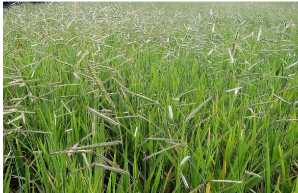
Field of Brachiaria grass packages