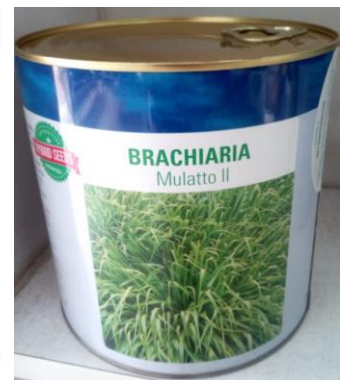
Examples of Brachiaria seeds in a 1 kg