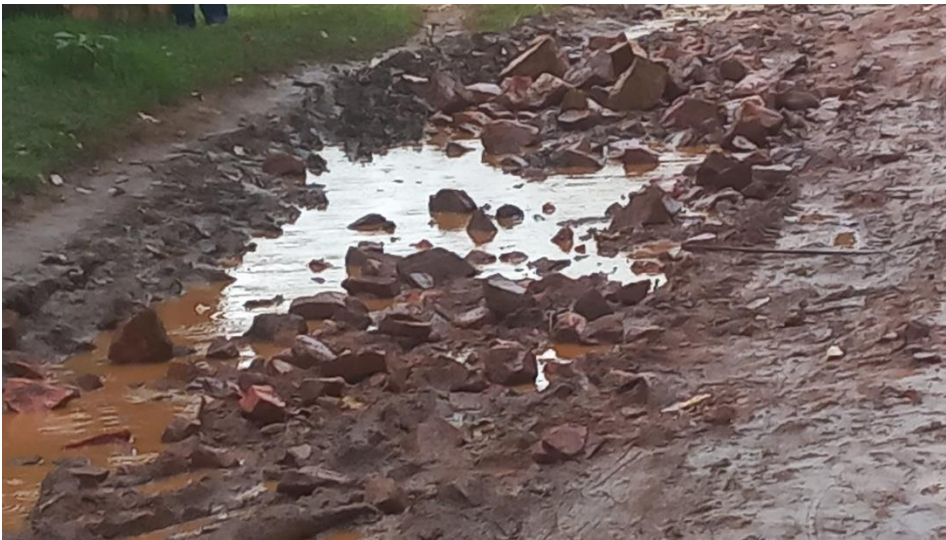
Photo #4: Road Section Requiring culvert for drainage 2No 600mm Culverts (1No for main road and 1No for Access to Kipkoibet Aggregation Centre)