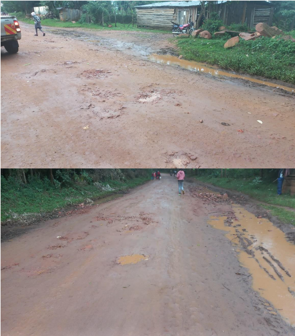
Photo #1&2: Road Sections Requiring spot improvement, murram and compaction