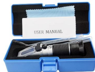
Honey Refractometer for Honey Moisture

Brix and Baume, 3-in-1 Uses, 58-90% Brix Scale Range Honey Moisture Tester, with ATC, Ideal for Honey, Maple Syrup,... 3-in-1 scale design makes you know three indexes at one time: honey moisture/ brix/ baume.