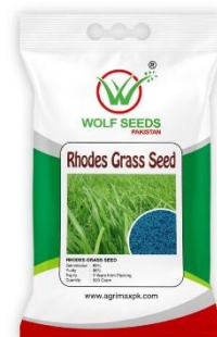
Field of Boma Rhodes grass Examples of 1 kg packets of Boma Rhodes seeds